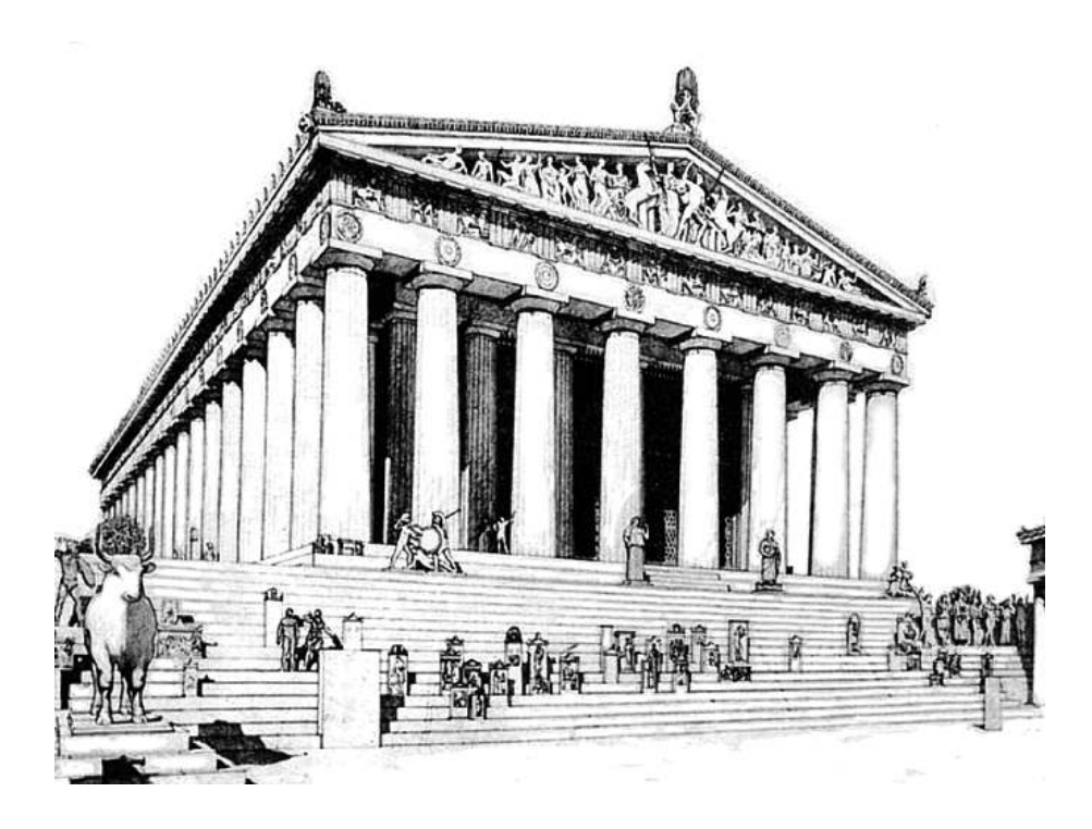
Figure 2. The Pathenon.

At that time it was when a very intelligent, serious, calm, noble, man became the new leader of the party of democrats, which was Pericles. This happened two years after the assassination of Efialtis.